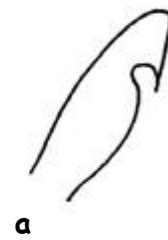
Figs. 1-4.- Zahradnikia taiwanica gen. & sp. nov. 1.- habitus; 2.- antenna of male; 3.- part of wing (rc - radial cell, rp - radius posterior, ms - medial spur); 4.- aedeagus (a- tip of median lobe, lateral aspect). (Figs. 2, 4 schematically, without setation).