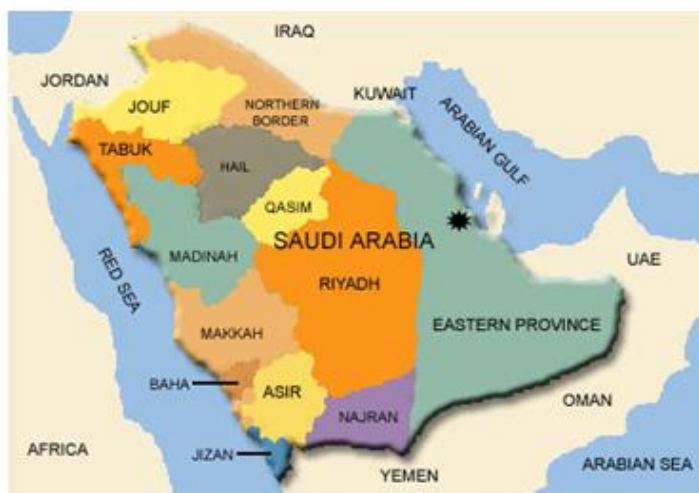
Map 1.- Saudi Arabia with locality of Attagenus logunovi sp. nov.

Etymology. The patronym is dedicated to my colleague Dmitri V. Logunov, Curator of Arthropods at The Manchester Museum (MMUE).