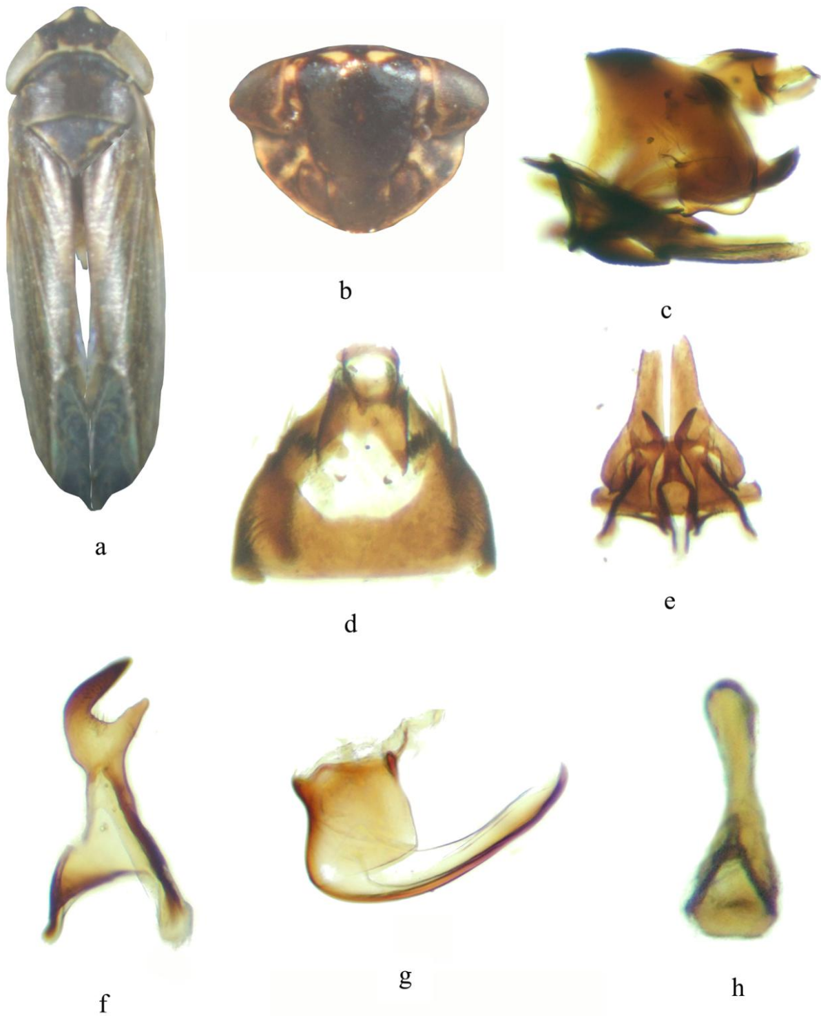
Fig. 1. - Aconurella erebus (Distant 1908):

a. - Habitus. b. - Face. c,d. - Pygofer lateral and dorsal view respectively. e. - Valve, subgenital plate, style, connective dorsal view. f. - style. g. - Aedeagus lateral view. h. - Aedeagus dorsal view