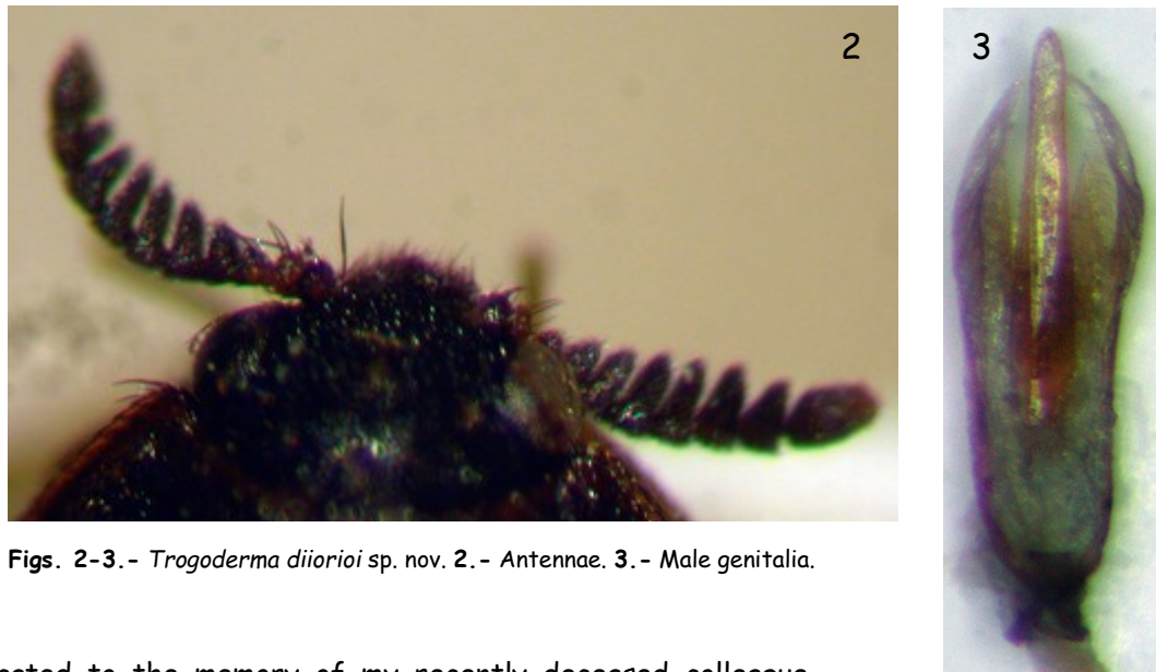
Figs. 2-3. - Trogoderma diiorioi sp. nov. 2. - Antennae. 3. - Male genitalia.